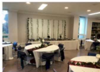
Our Members' Lounge can hold up to 100 people for weddings, receptions, parties, proms, corporate meetings, fundraisers, etc.