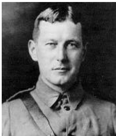
On May 3 rd , 1915, Lt. Col. John McCrae wrote In Flanders Fields