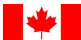
National Flag of Canada

Let us know! Send your comments to: messenger@montgomerylegion.ca We promise to read everything you send.